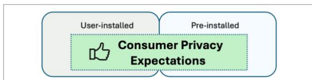
Fig. 3. Consumers can have reasonable privacy expectations in user-installed software but also in pre-installed software. Whether software is user- or pre-installed has no relevance for consumers' privacy expectations.

For the CCPA, the interpretation of choice in light of the privacy-protective nature of a software is explicit. According to the CCPA a "consumer exercises their choice by affirmatively choosing the privacy control, including when utilizing privacy-by-design products or services" [22]. In this regard the CCPA provides a blueprint for the CPA, whose Section 6-1-1313(2)(e) mandates that its opt-out mechanisms be as consistent as possible with similar mechanisms required by other US laws. To achieve this goal, the CPA's interpretation of choice should be harmonized with the CCPA recognizing that selecting privacy-protective software is, in itself, the exercise of a consumer's choice.